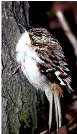
Brown Creeper

Aurora Sanctuary Bedford Reservation Big Creek Reservation Brecksville Reservation Gates Mills Geauga County Hiram