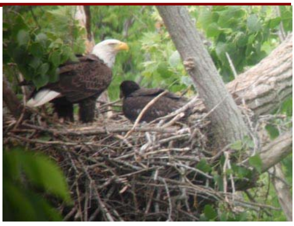
A Bald Eagle with chick in the Rocky River IBA

To see the list of birds and great photographs of both the Ultrabird and Ultrawalk, visit the website, www.wcasohio.org and click on the Pictures and Reports navigation button.