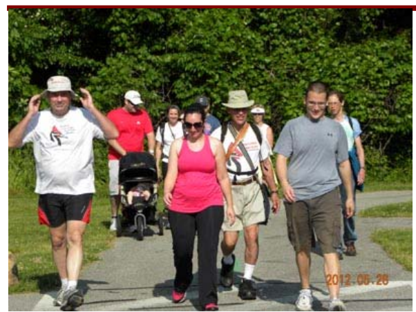
UltraWalkers joined by 5 milers

(Ultrawalk/ Ultrabird, cont'd From Page 1)