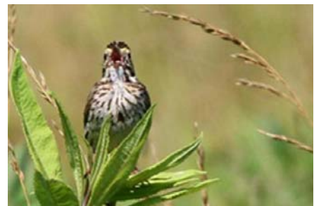
Savannah Sparrow

in her program, " Birds Aren't the Only Ones That Sing. "