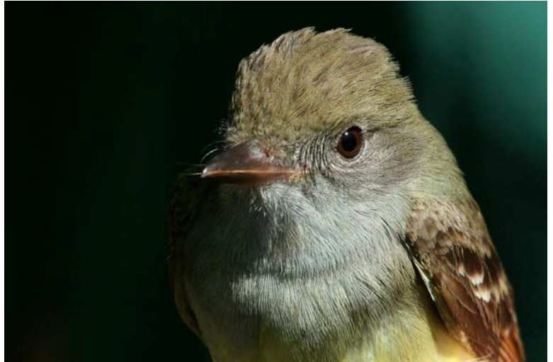
Great-crested Flycatcher