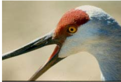
Sandy Ridge Sandhill Crane

The vision of WCAS is to encourage awareness and appreciation of the natural world in our community.