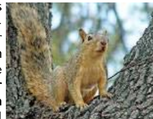
Fox Squirrel