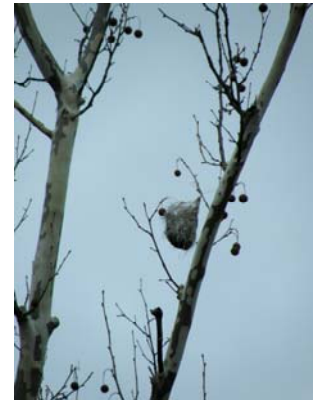
Oriole Nest By Penny O'Conner

rivers and streams were open. Smaller lakes and ponds were iced over. Large amounts of fruits were on trees and shrubs in certain areas. All in all a great day with great coverage of the count circle thanks to all of the folks participating. The list below of 87 species on count day/count week is fantastic with some nice surprises. A couple species need further verification so the list may change. Count week species are in italics , rare or unusual species are in bold .