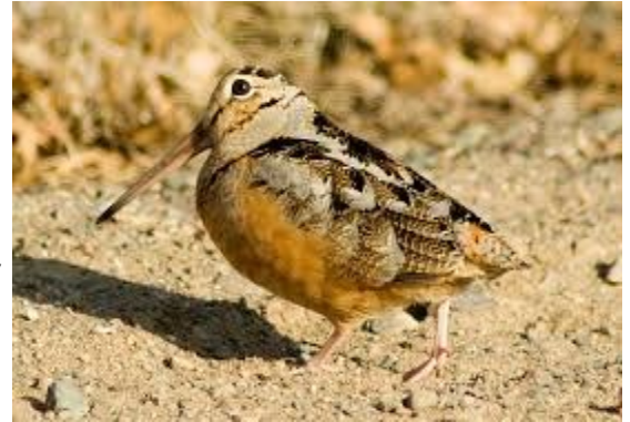
American Woodcock

Beginning on Sunday, April 12, plan to enjoy spring migration at the Audubon Spring Bird Walks, held the last three Sundays in April and the first three Sundays in May, at many