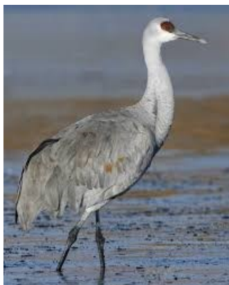
Greater Sandhill Crane