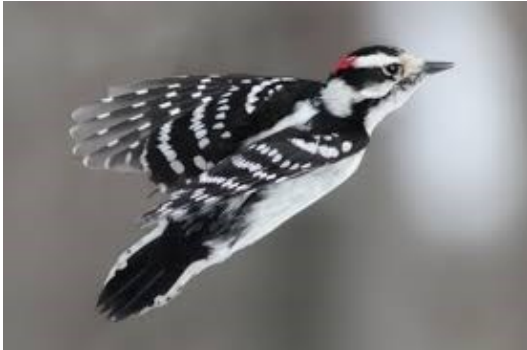
Downy Woodpecker

Target Species: Woodpecker & Spring Migrants