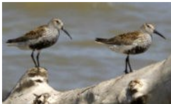
Dunlins at ONWR