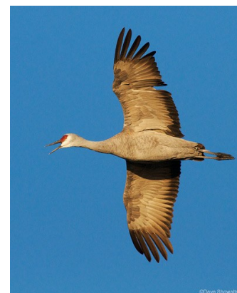
Greater Sandhill Crane