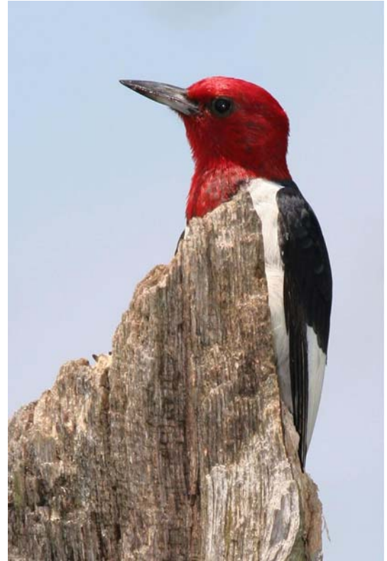
Red-headed Woodpecker

To find out about current environmental issues, see our "Take Action" webpage. Find them at www.wcasohio.org