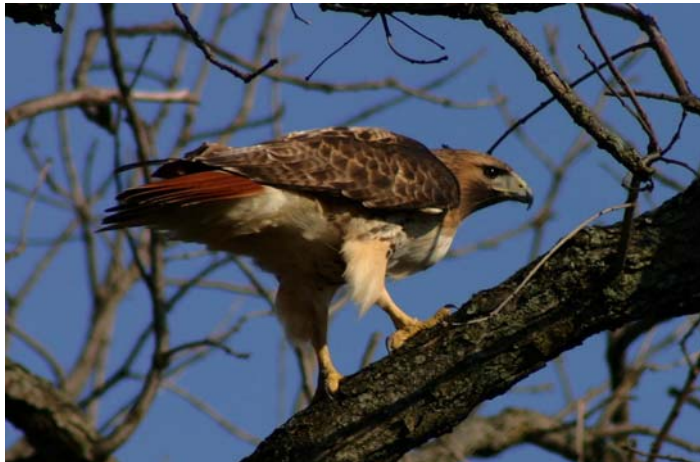
Red-tailed Hawk

Now everyone can participate in the Rocky River IBA Survey.