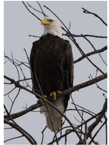
Bald Eagle © John Sims