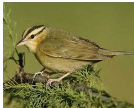
Right - Worm Eating Warbler