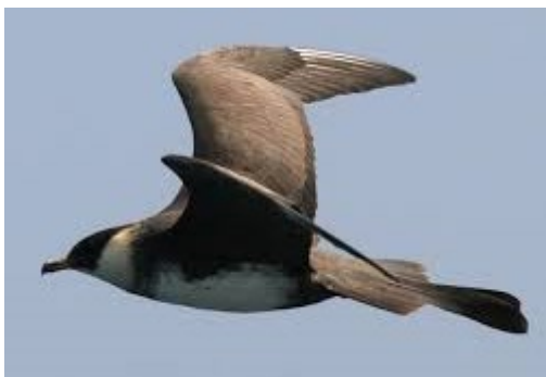
Left - Pomarine Jaeger

Raging northwest lake winds with temperatures in the teens and a Pomarine Jaeger on the river, fog moving over the fields at Killdeer Plains while a Short Eared Owl sits waiting on a barn roof, Worm Eating Warbler near the beach AND a Golden Winged Warbler near the west entrance at Magee SIMULTANEOUSLY!! The students of the Ohio Young Birders Club, Northeast Chapter, have been busy building their bird lists while encountering some AMAZING birds, exciting places and even more amazing birders. Join OYBC leaders, Bev Walborn and Liz McQuaid and perhaps some of the young birders themselves, to learn about the organization, where they have traveled and what is planned for the future in the program, " Ohio Young Birders Club – Northeast Chapter ".