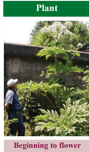
Beginning to flower

Branch County Calhoun County Gogebic County Ingham County Jackson County Kalamazoo County Kent County Manistee County Oakland County Ottawa County Saginaw County